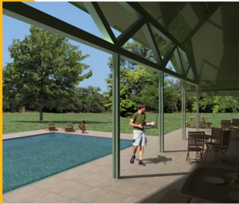
pool terrace view