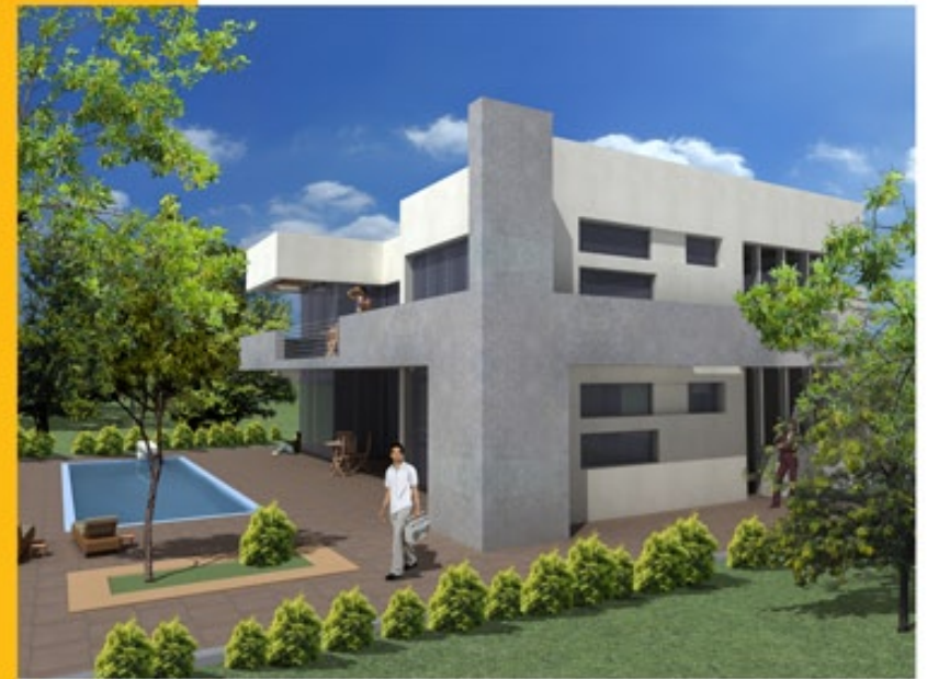
pool terrace view